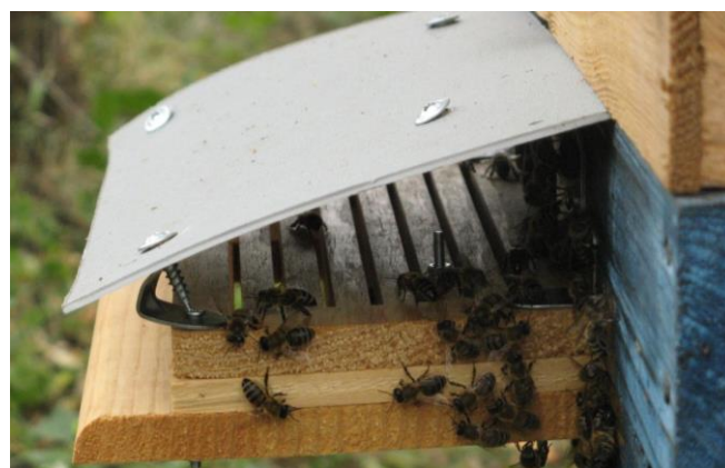
Figure 1. Entrance block of LPRS-1

For the implementation of the working hypothesis of increase in the effectiveness of the fight against the varroosis of bees and the preservation of their potential we provided multifunctional design of the device, in which the effect on Varroa mite will be carried out by electromagnetic radiation of the ultraviolet spectrum of light emitting diodes powered from photocells. The device for UV irradiation of bees and mites includes entrance block, LEDs, power supply of LEDs, protective grid, switching and control system. Structural-technological scheme of one of the LPRS-1 type provided with UV irradiation module is shown in Fig. 1.