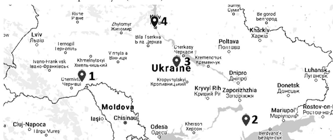
Figure 1. Map of Ukraine with locations where studied samples originate from: 1 — BA-C-10-Cher (Khotyn district, Chernivtsi region); 2 — BA-D-12-Mel (Voznesenka village, Melitopol district, Zaporizhzhia region, Ukraine); 3 — BA-C-12-Sm (Makiivka village, Smila district, Cherkasy region); 4 — State Scientific Control Institute of Biotechnology and Strains of Microorganisms

From the MLVA data a UMPGA-tree was built using BioNumerics software (version 6.6).