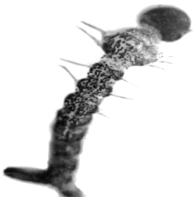
Figure 1. Larva of the blood-sucking mosquito Aedes communis (De Geer, 1776) with numerous melanotic pseudotumors in the form of dark spots throughout the body