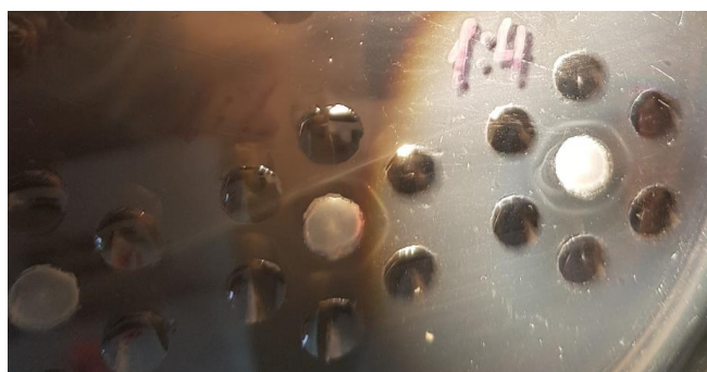
Figure 4. Lines of precipitation in ID test of the strain FLK-Pol after 55.5 months of storage in cryobank conditions from 5 to 17 passages after thawing. Dilution 1:4 (+++).