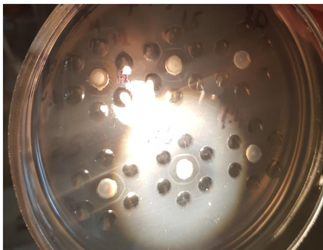
Figure 3. Lines of precipitation in ID test of the strain FLK-Pol after 55.5 months of storage in cryobank conditions from passage 5 to 17 after thawing. Dilutions from 1:1.5 to 1:3 (++++).