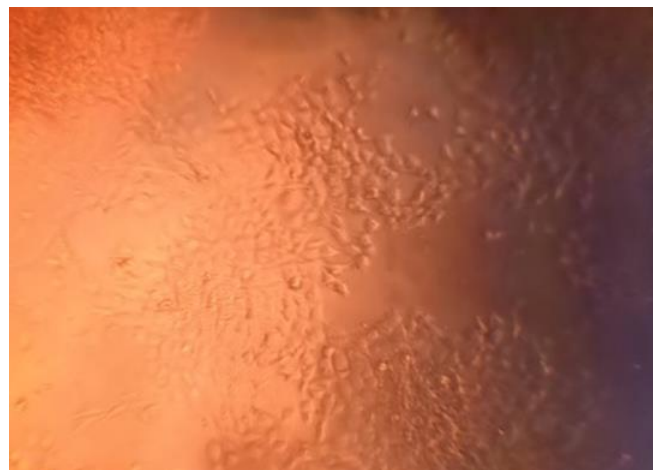
Figure 1. FLK 50/100 cell culture morphology at the third passage after thawing (magnification × 60).

culture line (FLK-71) on the third and fifth passages after thawingshowed that on the first day of cultivation, 30 to 35% of the monolayer was formed by fibroblast-like cells with large nuclei. In addition, several morphological types of cells were observed: spindle-shaped and polygonal. The morphology of the line (FLK 50/100) was represented by epithelial-like cells with a perinuclear space around the nucleus. On the first day of growth (FLK 50/100), 60% of the monolayer was formed (Fig. 1).