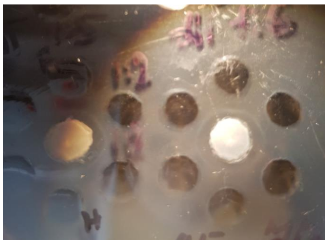
Figure 5. Lines of precipitation in ID test strain FLK-Pol after 55.5 months of storage in cryobank conditions from passage 5 to 17 after thawing. Dilution 1:6 (++)

Thus, the antigen-producing biological activity of the FLK-BLV strain (FLK-Pol) was preserved from the 5th passage and further up to 22 passages (passage period) during the studied storage periods, namely from 55.5 months (FLK-Pol) to 201 months of storage (FLK-SBBL) and 206.5 months (FLK 50/100) in the conditions of the NSC 'IECVM' cryobank. However, for the FLK 50/100 strain, up to 10 passages after thawing are required to fully restore the titers of its biological activity.